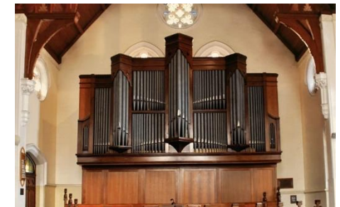
St Andrews, Perth

Roberts Organ Relocation and Adaptive Re-Use through Rebuilding Appeal