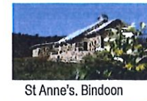
St Anne's, Bindoon

An Advent wreath is a wreath of laurel, spruce or similar foliage with four candles that are lighted successively in the weeks of Advent to symbolise the light that the birth of Christ brought into the world. Traditionally three of the candles are purple, the colour of kings and of penance. A rose-coloured candle is used to mark the Third Sunday of Advent as a time to rejoice over the closeness of Christmas and the coming of Christ. Children love the beauty of the simple traditional ceremony. Lighting candles in an Advent Wreath is a simple way to start a tradition of family worship in the home. Those who participate will cherish the experience all their lives.