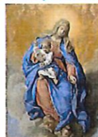
Our Lady of the Rosary