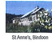
St Anne's, Bindoon