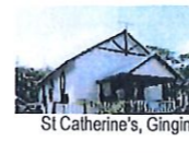
St Catherine's, Gingin